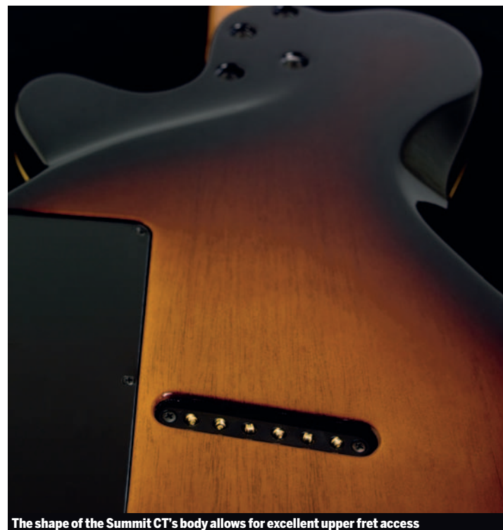
The shape of the Summit CT's body allows for excellent upper fret access