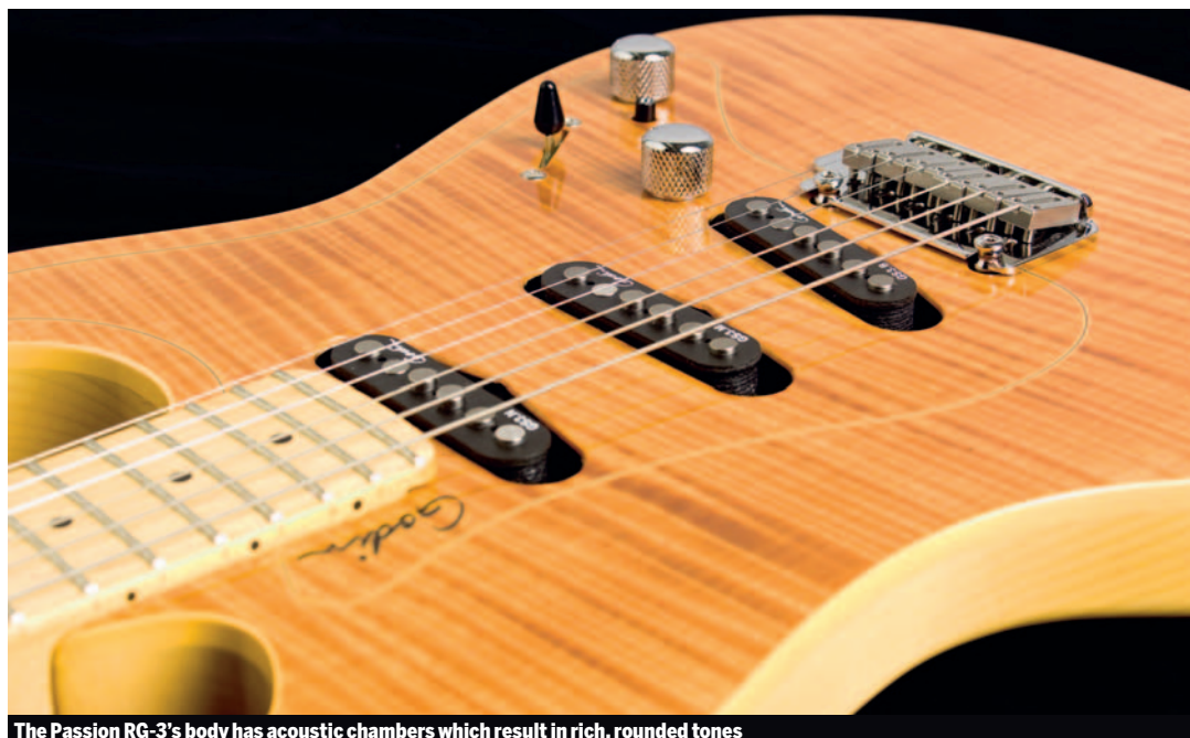
The Passion RG-3's body has acoustic chambers which result in rich, rounded tones

As usual, this Godin is finished magnificently – bound top, beautifully dressed frets, high gloss body, real chrome. Even the two back plates are flame maple. And talk about protected – even the gig bag has a case! The Passion RG-3 is simple to operate (volume, tone, 5-way, HDR switch), the tremolo is super smooth, and there's plenty of upper fret access with that recessed heel. Best of all, it's a finely crafted guitar that's built to last. Yes, this has a bluesy side to it, but mostly the RG-3 wants to rock.