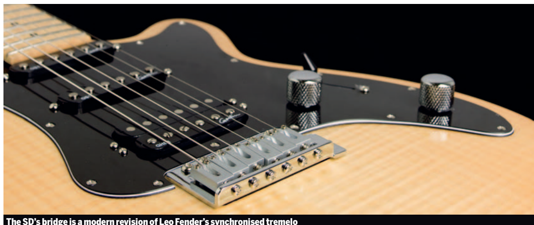
The SD's bridge is a modern revision of Leo Fender's synchronised tremolo

The SD is another example of a working class guitar that doesn't look "down market" – it has what you need to do the business, and nothing extraneous. It's well presented, plays great and has some solid tones that don't thin out as you climb the neck.