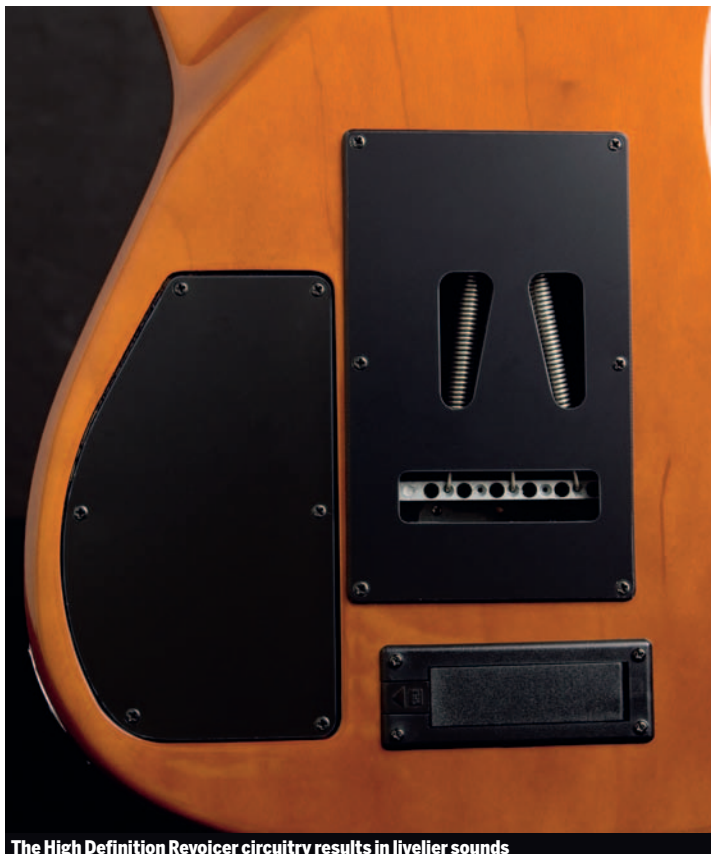
The High Definition Revoicer circuitry results in livelier sounds

Guitarist says: This is a sleek, souped-up electric, able to handle a lot of styles